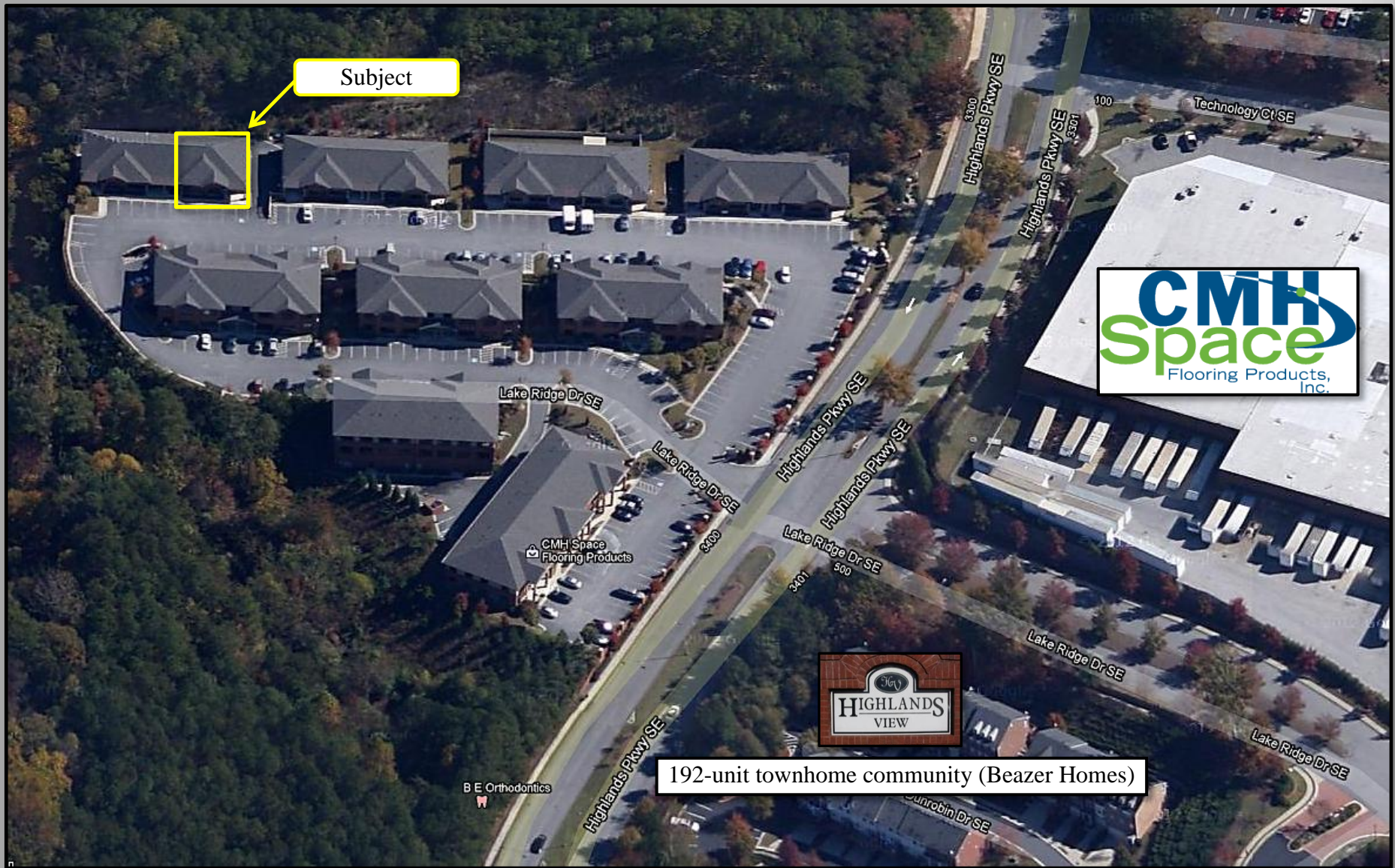
192-unit townhome community (Beazer Homes)